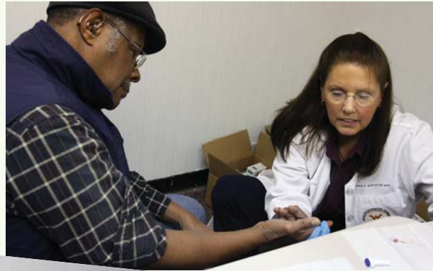
Members take advantage of extended Local 860 benefits.