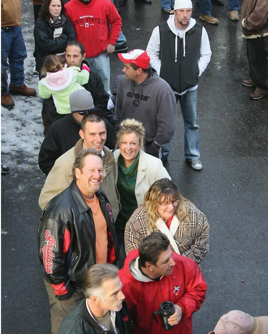
2008 Members' Gift Distribution