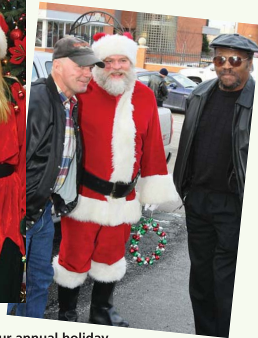
Santa makes a surprise visit to Local 860 headquarters, during our annual holiday distribution of gifts.